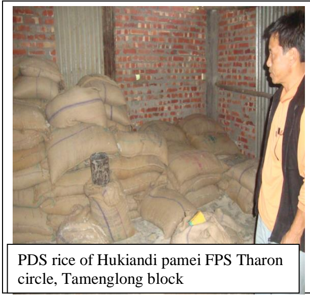
PDS rice of Hukiandi pamei FPS Tharon circle, Tamenglong block